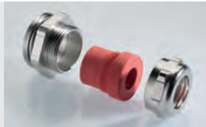
Abb. 2 Fig. 2

Messing vernickelt Zylindrisches Whitworth-Zoll-Gewinde DIN EN ISO 228-1 Mit O-Ring Schutzart IP 68 bis 10 bar Zugentlastung bis Klasse A, EN 62444