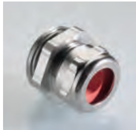
Abb. 1 Fig. 1